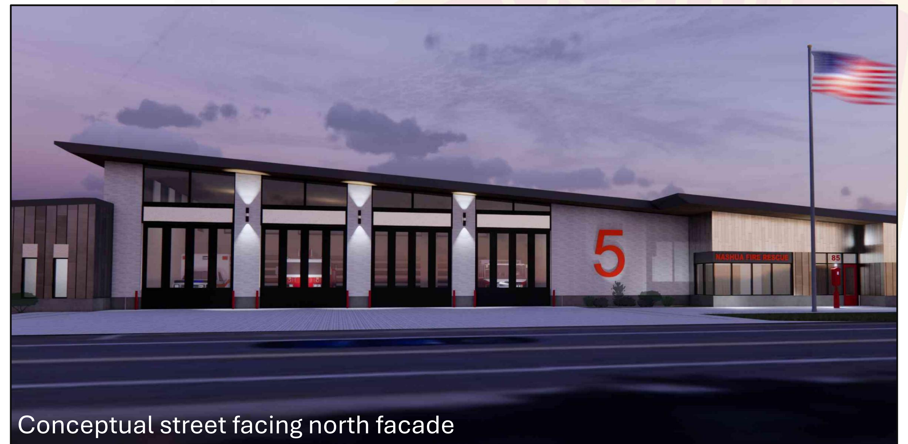
Conceptual street facing north facade