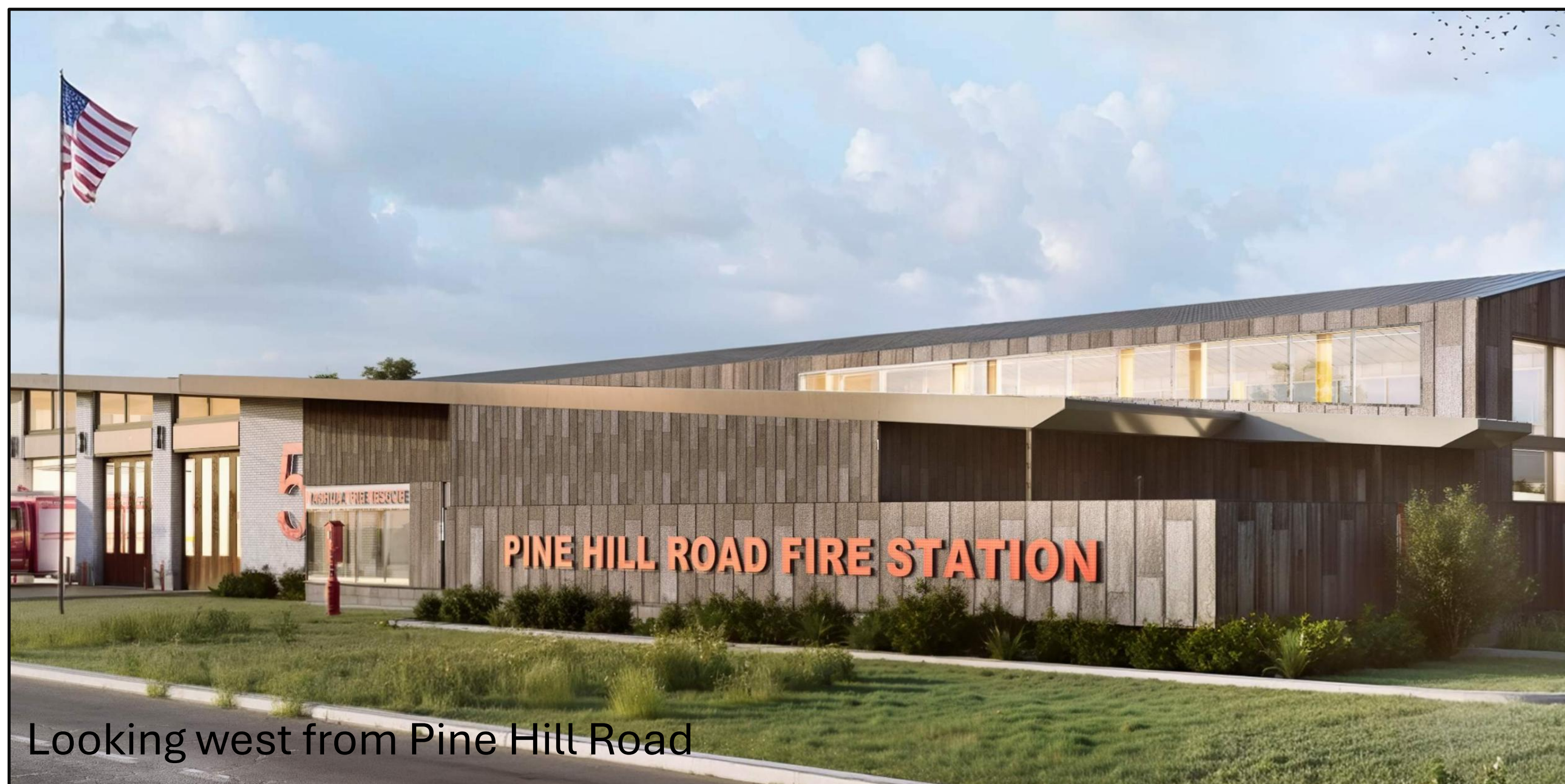
Looking west from Pine Hill Road