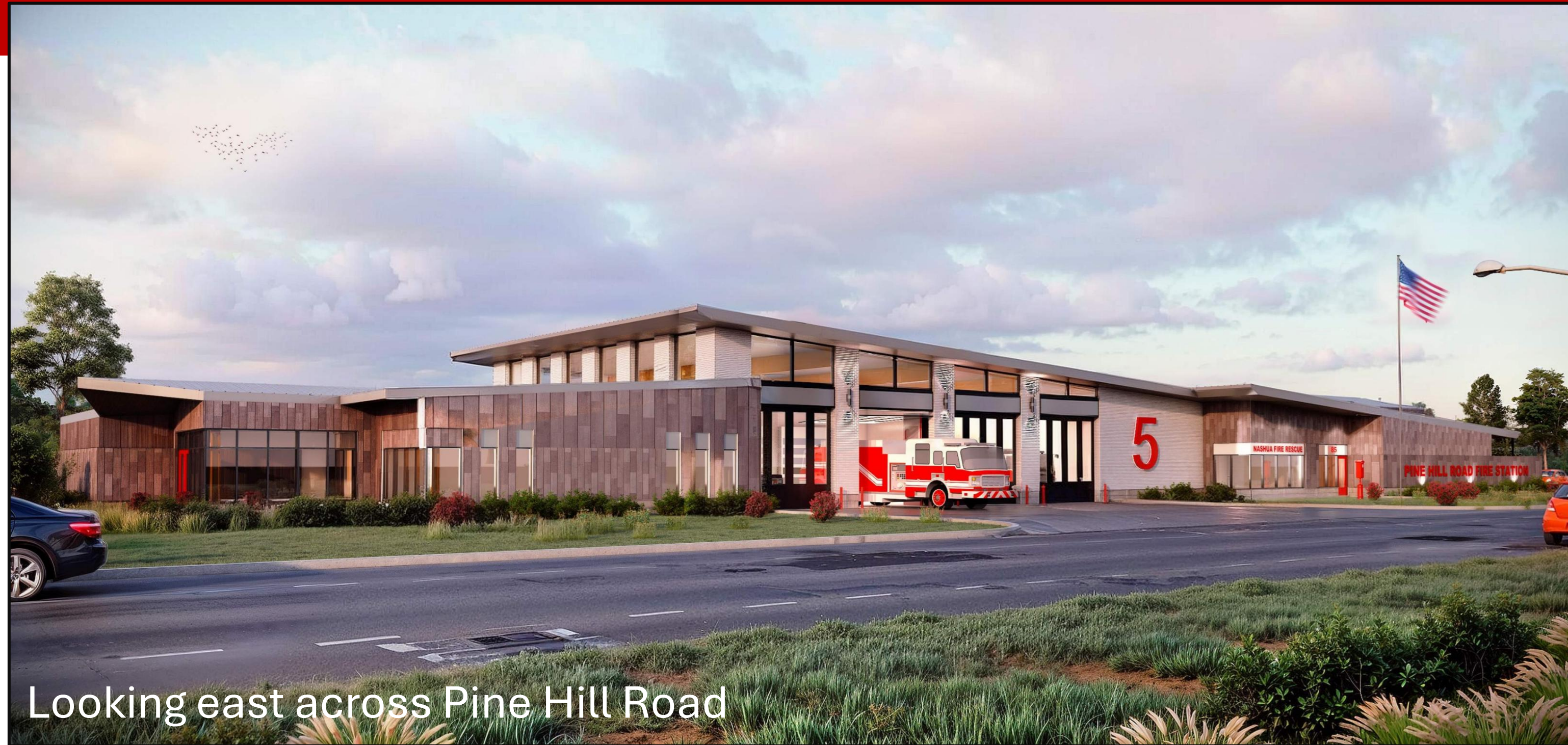
Looking east across Pine Hill Road