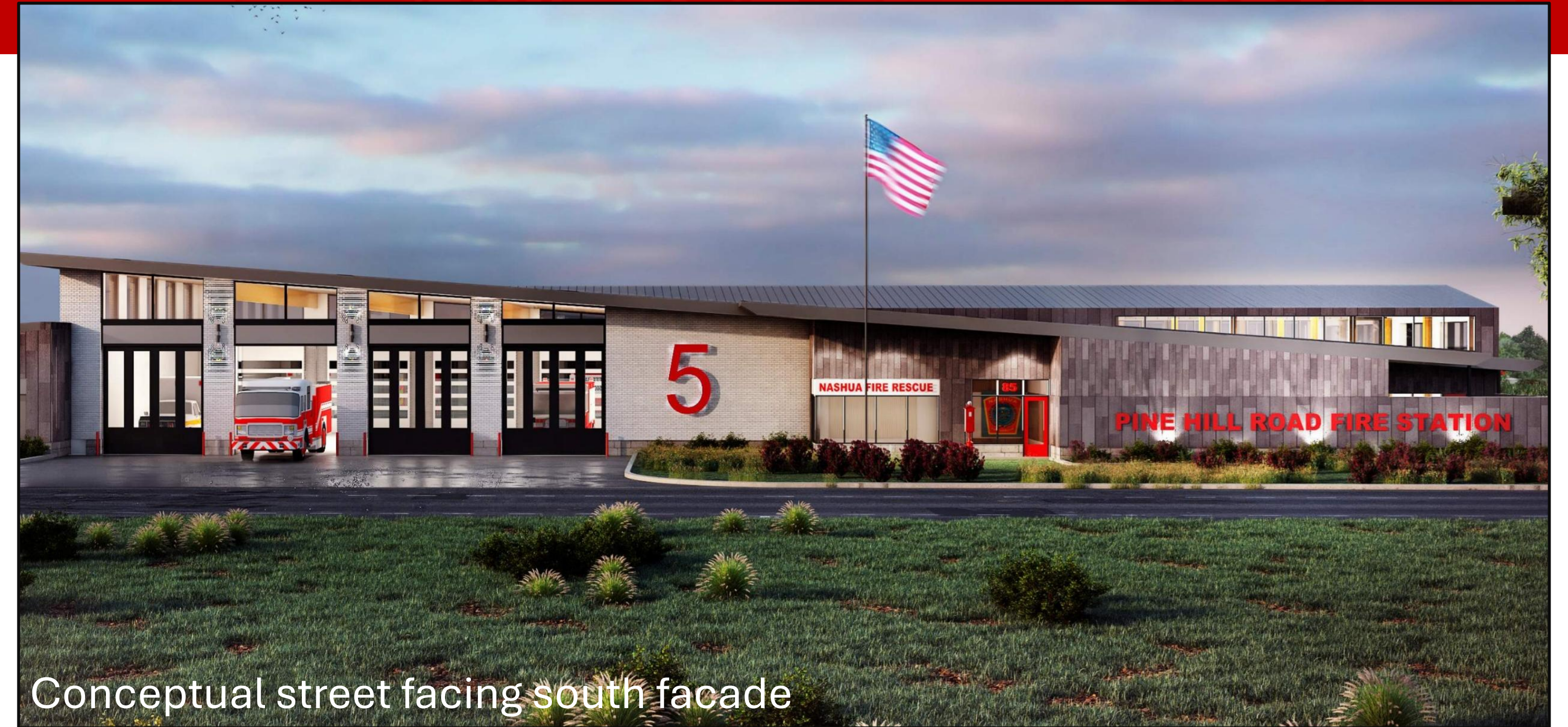
Conceptual street facing south facade